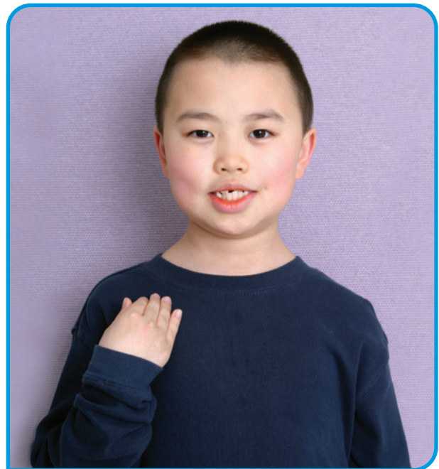
Sign of the Cross

Sign of the Cross The action of blessing oneself in the name of the Holy Trinity—Father, Son, and Holy Spirit